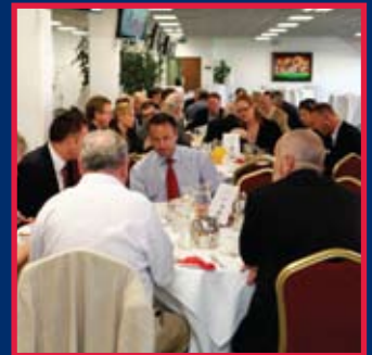
Pre Match Reception