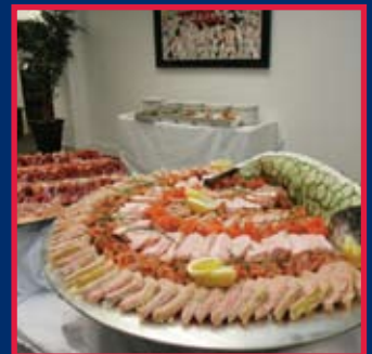
Hot & Cold Buffet